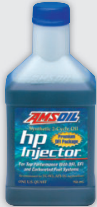
NMMA TC-W3 API TC